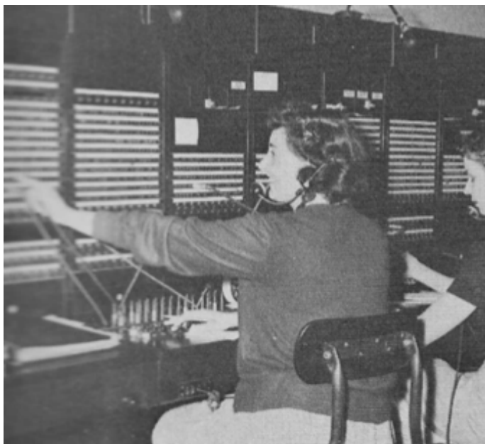
Switchboard, Bunker Hill, @1957